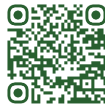
Donate to Anchor Ministries

Anchor Ministries International (Pastor in Residence Ministries, Inc.) is a 501(c)(3) nonprofit organization. All gifts are tax-deductible as allowed by law. ECFA accredited. Candid.org Platinum Level of Transparency 3144 Michael Ave SW, Wyoming, MI 49509 | (844) 585-1234 | info@anchorministries.org